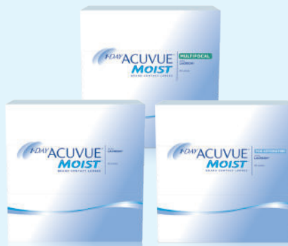
1-DAY ACUVUE® MOIST 1-DAY ACUVUE® MOIST for ASTIGMATISM 1-DAY ACUVUE® MOIST MULTIFOCAL