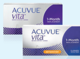
ACUVUE® VITA ACUVUE® VITA for ASTIGMATISM