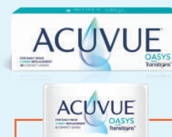
ACUVUE® OASYS with Transitions™

- 6-Pack Plastic Container - No box flaps required for this product only