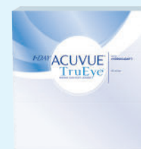
1-DAY ACUVUE® TruEye®