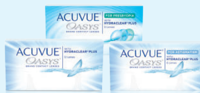
ACUVUE® OASYS with HYDRACLEAR® PLUS Technology ACUVUE® OASYS for ASTIGMATISM ACUVUE® OASYS for PRESBYOPIA