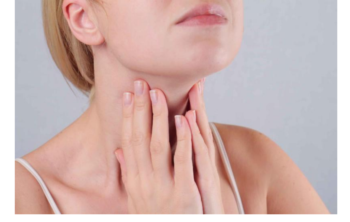
Thyroid Health What is Graves' disease?

This month we want to talk more about our thyroid health, focusing on Graves' disease: what it is, its symptoms and how to treat it.